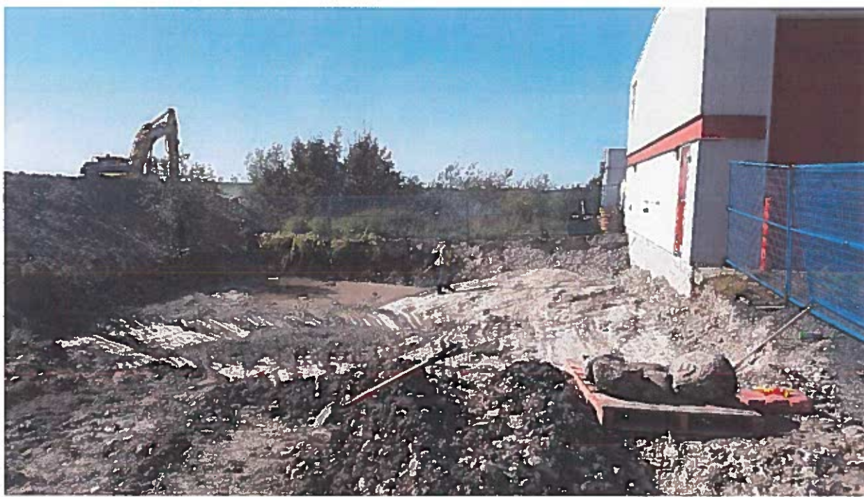
Digging foundation for the new 2-bay garage

The construction of a new 2-bay garage has begun beside the existing fire hall in Dettah. The purpose of the new garage is to house the second water truck and to accommodate space for other YKDFN owned vehicles and equipment.