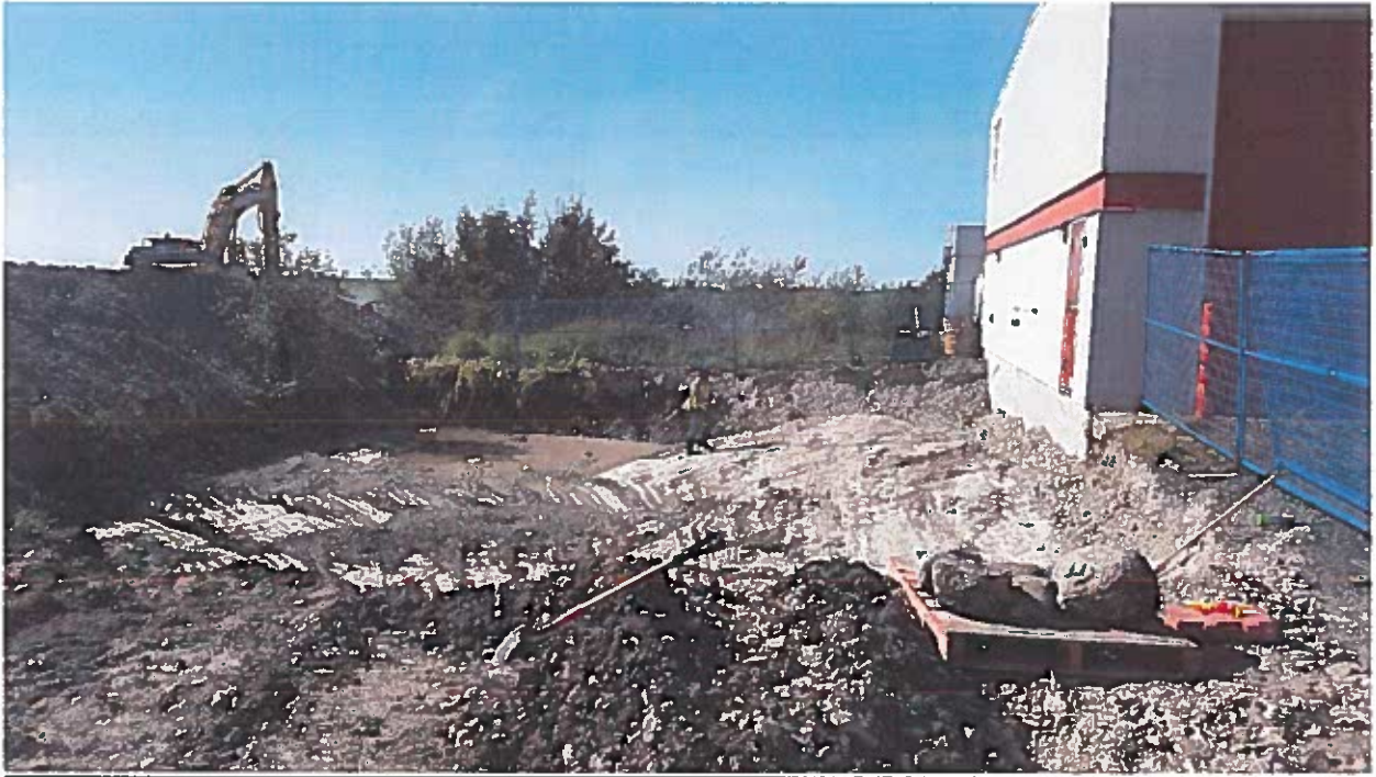
Digging foundation for the new 2-bay garage

The construction of a new 2-bay garage has begun beside the existing fire hall in Dettah. The purpose of the new garage is to house the second water truck and to accommodate space for other YKDFN owned vehicles and equipment.